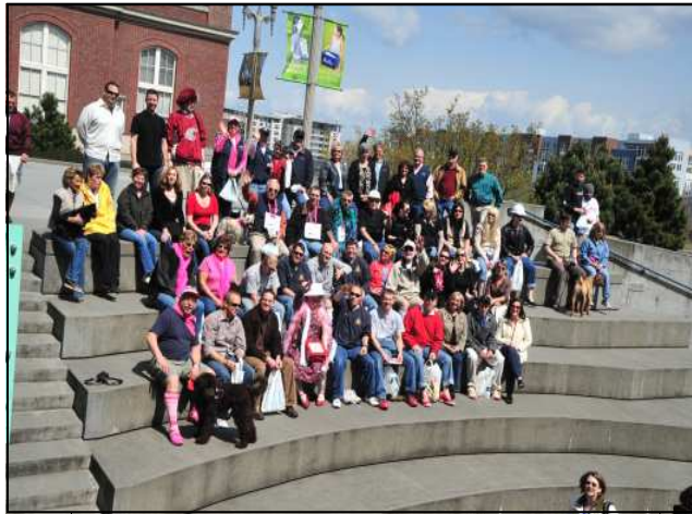
MANY OF THE WALKERS FOR 2008

T hey came, they walked...grandfathers, fathers, sons, brothers, husbands, concerned young men, and the women that came to support them. Well over 100 walkers strutted the streets. Master Builder's Association provided their Miracle Milers team with many walkers, as did law enforcement, Pierce County Department of Corrections, PLU programs, and attorneys, social workers, bikers and folks from all walks of life. From the look of things, the walkers had fun, too. Smiles and laughter abounded.